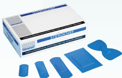
26160 Detectable First Aid Blue Plasters 100s