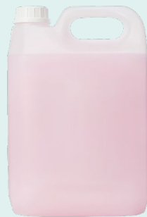
151416 Pink Pearl Hand Soap 5 Litres