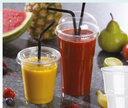
VAR Smoothie Cups, Tulip (10oz) 50s Smoothie Cups, Tulip (12oz) 50s