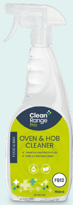
300757 Clean Range Pro Oven & Hob Cleaner 750ml