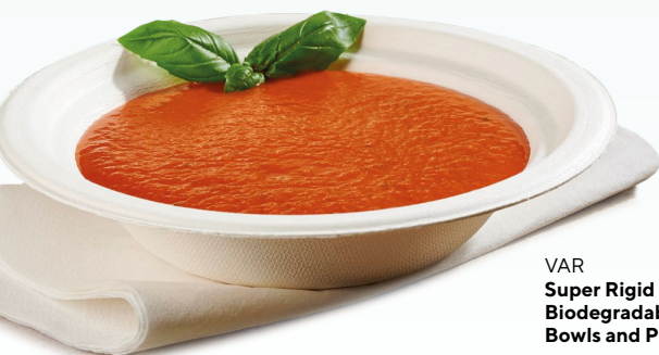
VAR Super Rigid Biodegradable Bowls and Plates 50s