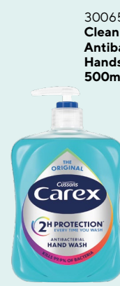
300657 Clean Range Pro Antibacterial Handsoap 500ml 119993 Carex Liquid Soap 500ml