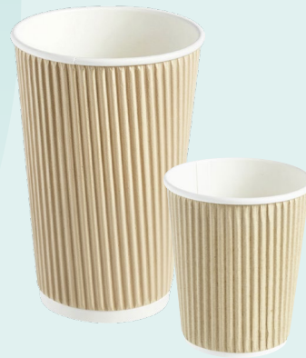
VAR Brown Kraft 3-Layer Ripple Cups: 8oz / 16oz (25s)