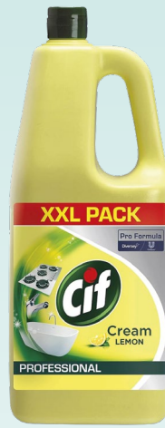
24693 Cif Lemon Cream 2 Litres