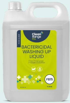
300956 Clean Range Pro Bactericidal Washing Up Liquid 5 Litres