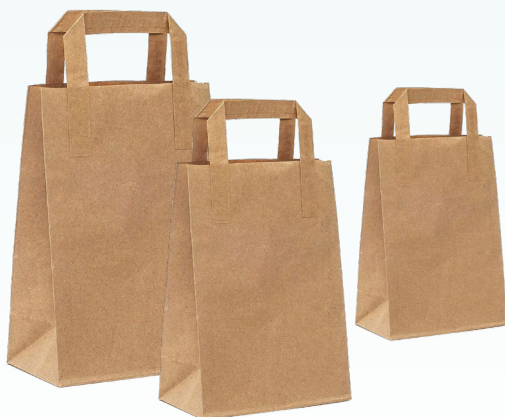
VAR Brown Kraft Carriers with Handles: Small, Medum and Large