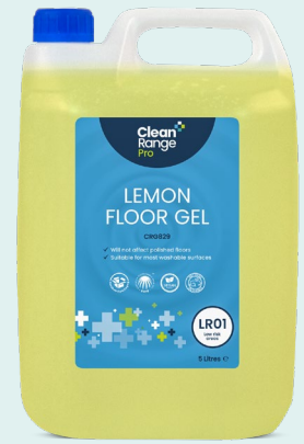
300906 Clean Range Pro Lemon Floor Gel 5 Litres