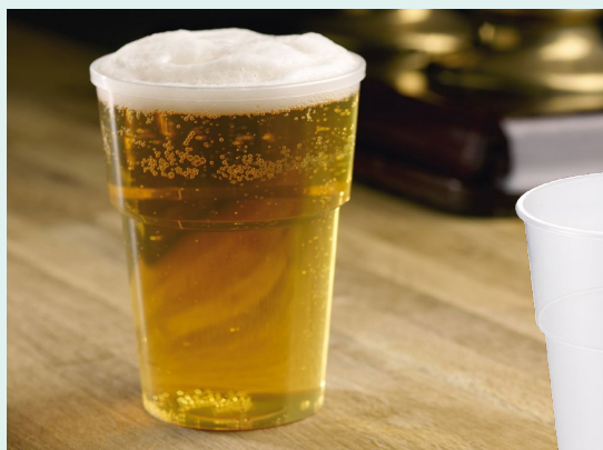
Katerglass Disposable Glasses: toughened C.E. marked 50355 10oz (50s) 50355 20oz (25s)