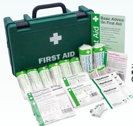
26370 First Aid Kit (10 Person)