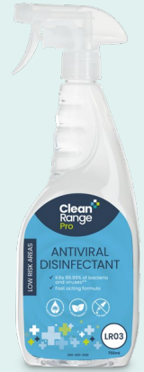
300756 Clean Range Pro Antiviral Disinfectant 750ml