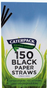
20407 Enviro Black Paper Straws 210 x 6mm