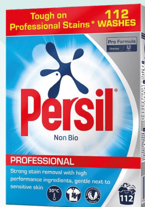
69576 Persil Professional Non Bio 112 washes, 5.6kg