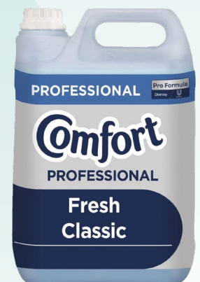
35165 Comfort Professional, Fresh Classic 5 Litres