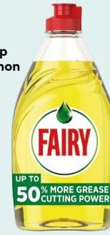
116201 Fairy Washing Up Liquid, Lemon 320ml