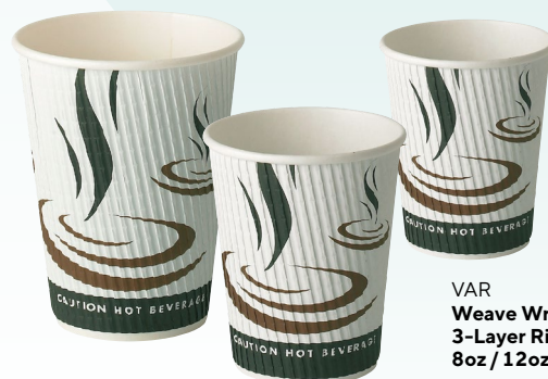
VAR Weave Wrap 3-Layer Ripple Cups 8oz / 12oz / 16oz (25s)