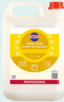
70441 Nilco Professional Heavy Duty Cleaner & Degreaser 5 Litres