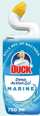
148046 Lifeguard Toilet Duck, Marine 750ml