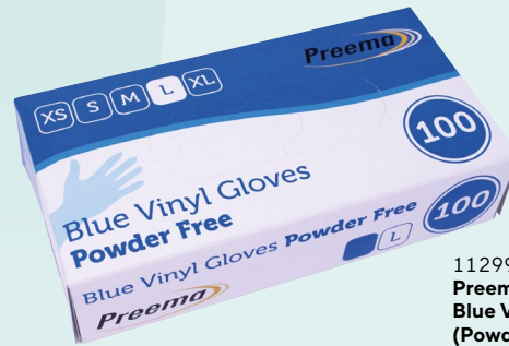
11299 Preema Blue Vinyl Gloves 100s (Powdered, Large)