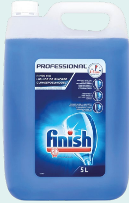
40559 Finish Professional Rinse Aid 5 Litres