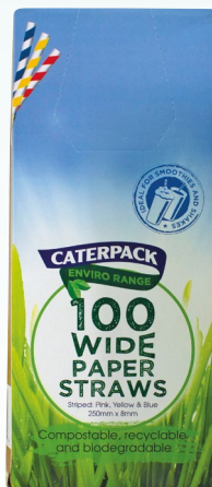
20390 Enviro Wide Paper Straws 250 x 8mm Striped: Pink, Yellow or Blue