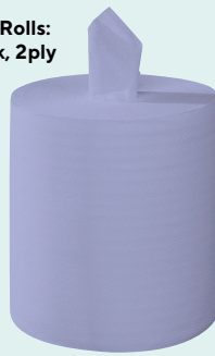
23378 Centrefeed Rolls: Blue, 6-pack, 2ply 150 Metres