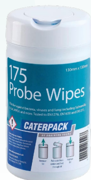
161296 Caterpack Sanitising Probe Wipes 175s