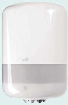
10036 Tork Centrefeed Dispenser White