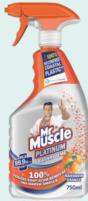
300757 Clean Range Pro Oven & Hob Cleaner 750ml