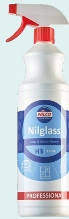
70367 Nilco Professional Nilglass Glass Cleaner 1 Litre