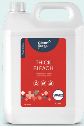
54105 Clean Range Pro Thick Bleach 5 Litres