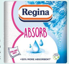
70973 Regina Kitchen Towels 2-pack