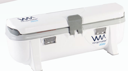
Wrapmaster Dispensers 175876 3000 Single 30cm 176056 4500 Single 45cm 50495 Duo 45cm