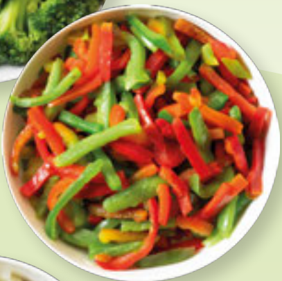
99885 Sliced Mixed Peppers 2.5kg