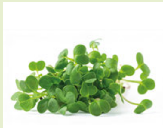
51488 Micro Cress Watercress