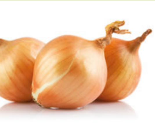
51287 Onions, Cooking