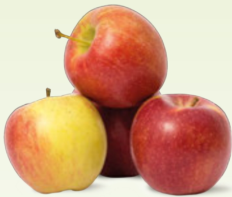
51072 Red Braeburn Apples 1kg