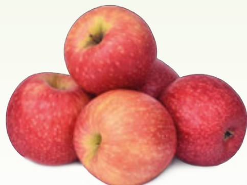
51055 Pink Lady Apples 1kg