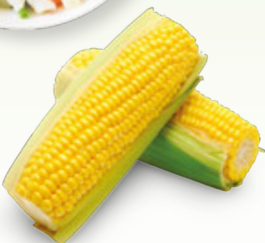
51218 Corn On Cob, Pre-Pack: 2s