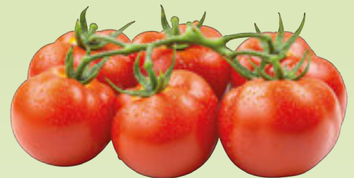
51330 Tomatoes, Plum Vine 5kg