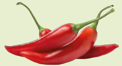
81554 Chilli, Red