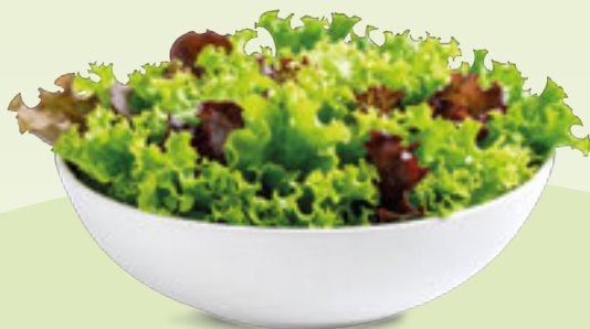
51149 Mixed Leaf Salad, Bags 500g