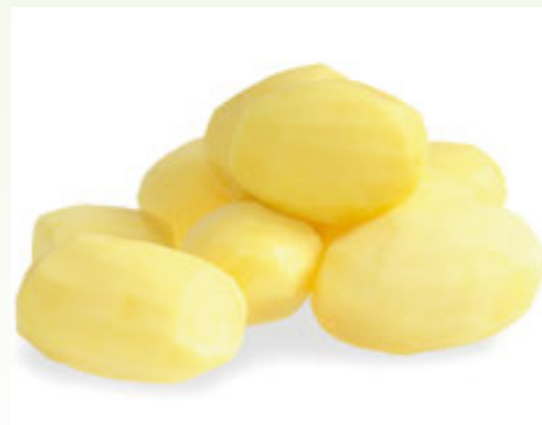
51137 Whole Potatoes, Peeled 5kg