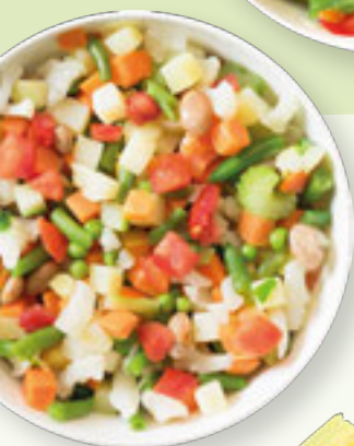
51216 Minestrone Mix 2.5kg