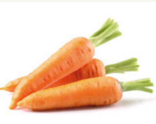
51257 Carrots, Large