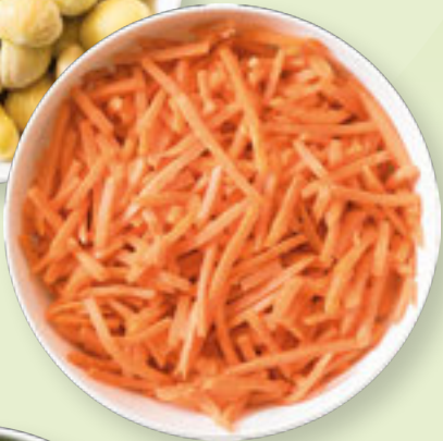
51205 Carrots, Julienne 2.5kg