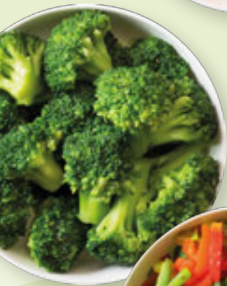
51200 Broccoli Florets 2.5kg