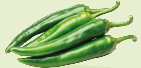
81543 Chilli, Green