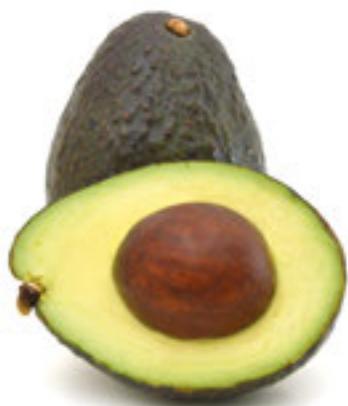
51151 Avocado (RTE)