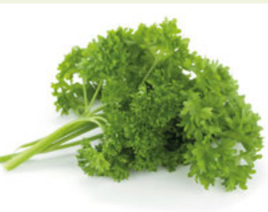
51187 Parsley, Curly 50g