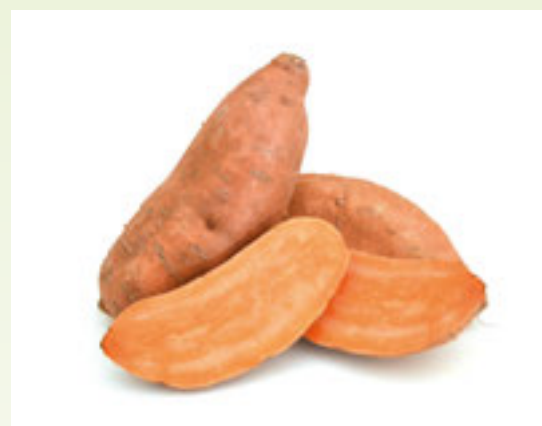
51143 Potatoes, Sweet 6kg