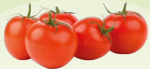
51323 Tomatoes 1kg (47-55mm)