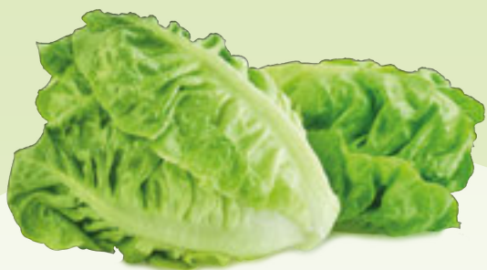
51164 Cos Lettuce