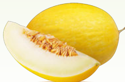
51055 Honeydew Melon