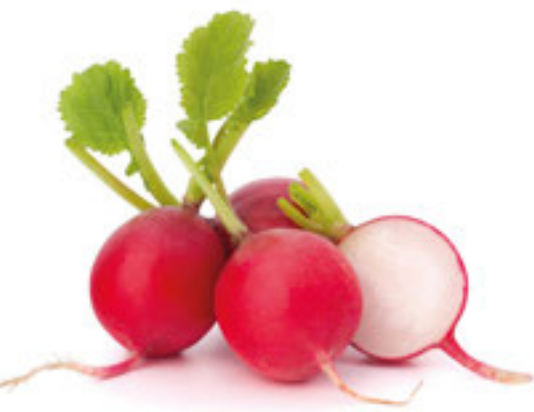
51190 Radishes, Cone 125g