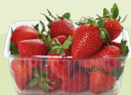
51129 Strawberries, Punnet 125g