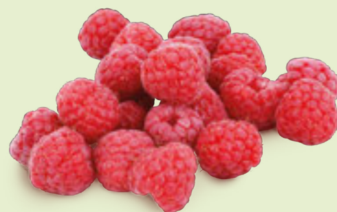
51124 Raspberries, Punnets 125g