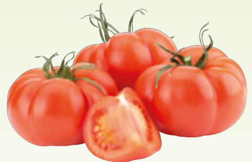
30463 Tomatoes, Beef 1kg