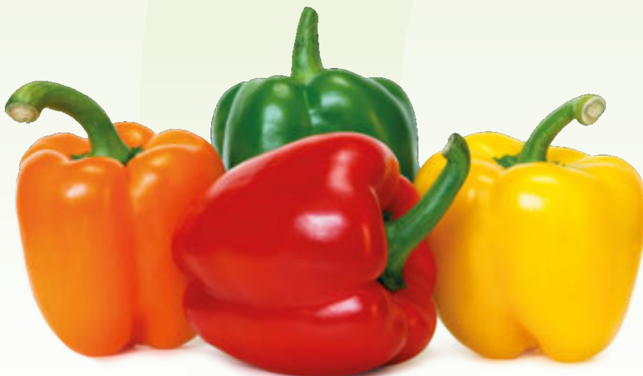
10710 Peppers, Mixed 5kg