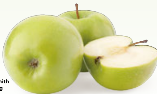
51069 Granny Smith Apples 1kg