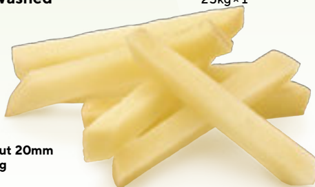
90342 Chips, Hand Cut 20mm Maris Piper 5kg