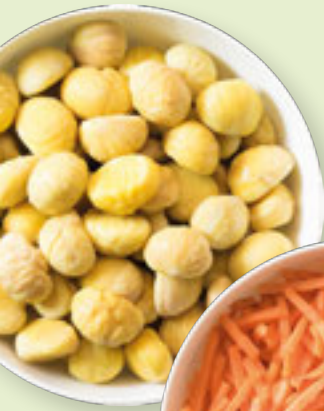
51208 Chestnuts Vac Pak Cooked 200g