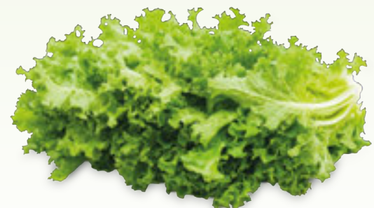
51165 Curly Endive Lettuce