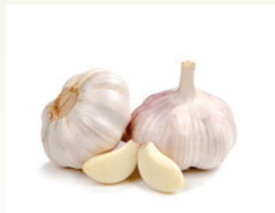
51269 Garlic Bulbs