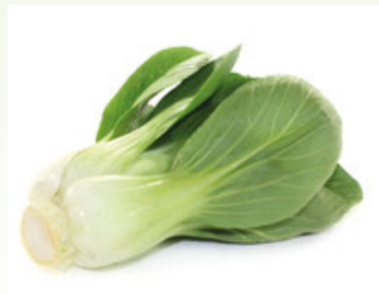
51276 Green Pak Choi