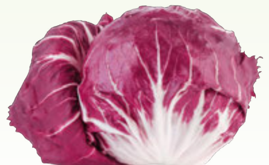
51172 Radicchio Lettuce