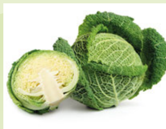
51245 Cabbage, Green Savoy