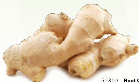
51310 Root Ginger