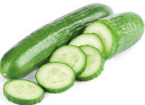
51160 Cucumber (35-40mm)