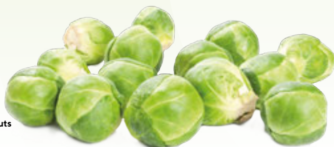
51241 Brussel Sprouts