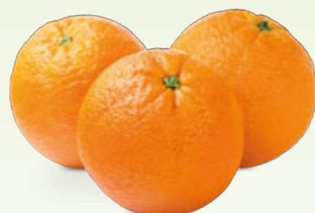
51110 Oranges, Large