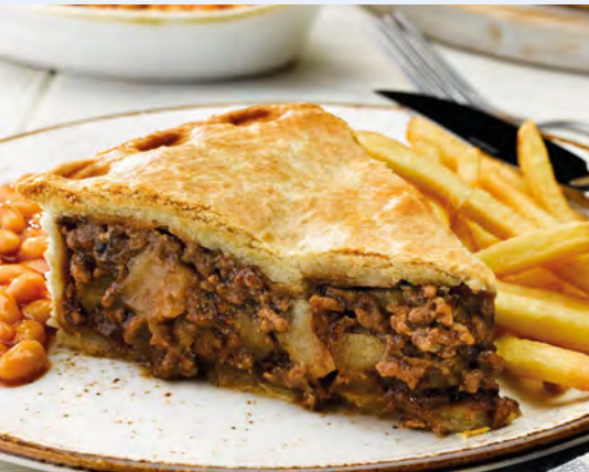
30726 Meat & Potato Pie 2.1kg Pre cut: 8 slices