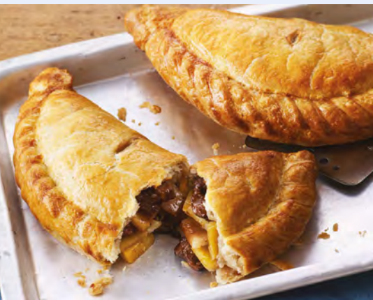
11140 Traditional Steak Pasties 283g