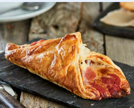
30697 Bacon & Cheese Turnover 123g