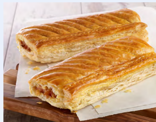
20894 Sausage Rolls (Unbaked) 6-inch, 120g