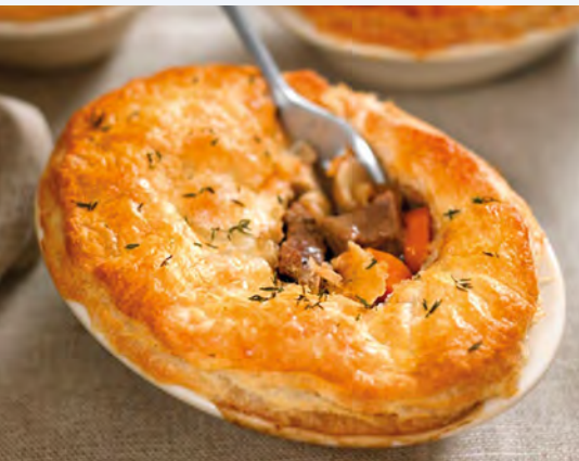
70661 Puff Pastry Sheets 625g