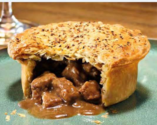
20865 Gastro Steak & Ale Pies 260g