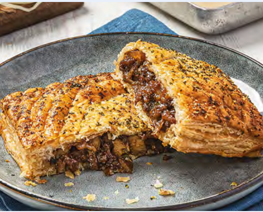
10875 Steak Slices 175g