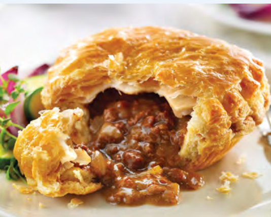
70499 Minced Beef & Onion Pie 170g