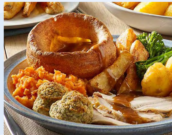
60827 Yorkshire Puddings 4-inch