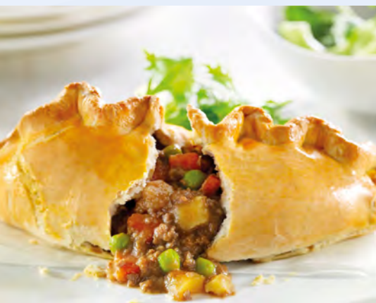
70467 Traditional Pasties 210g, Baked