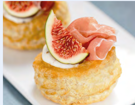
70703 Vol au Vents (Medium)