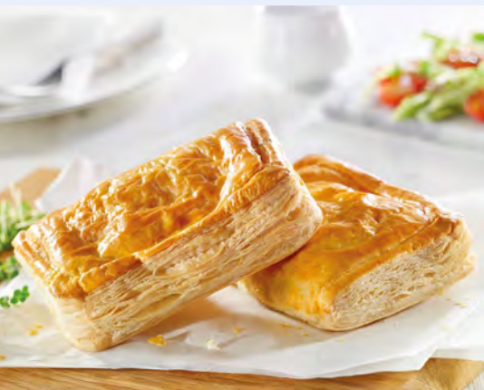
70475 Cheese & Onion Pasties 175g, baked