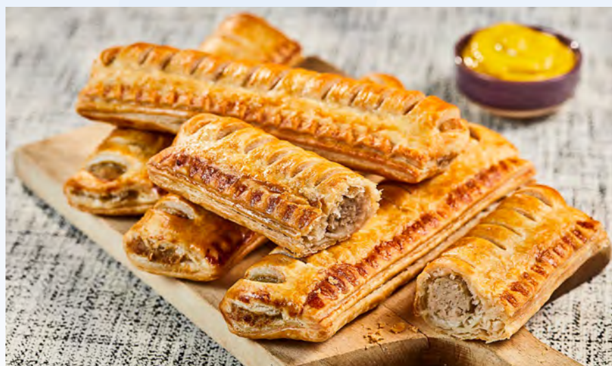
11129 Sausage Rolls (Unbaked) 8-inch