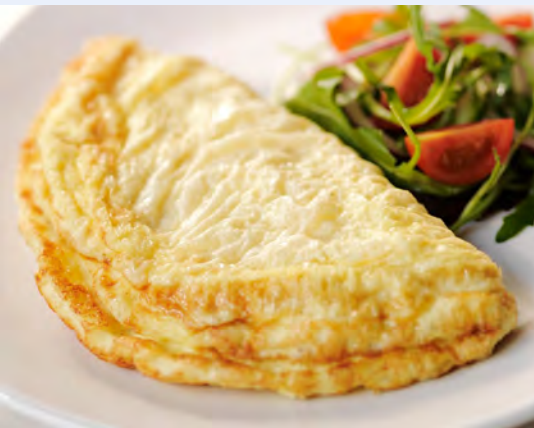
70673 Plain Omelettes 100g