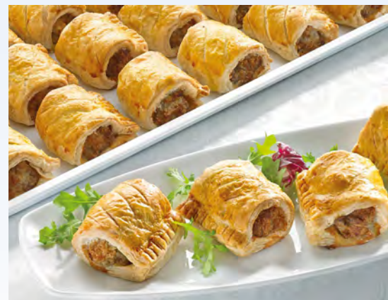
10614 Cocktail Sausage Rolls 55g (Unbaked)