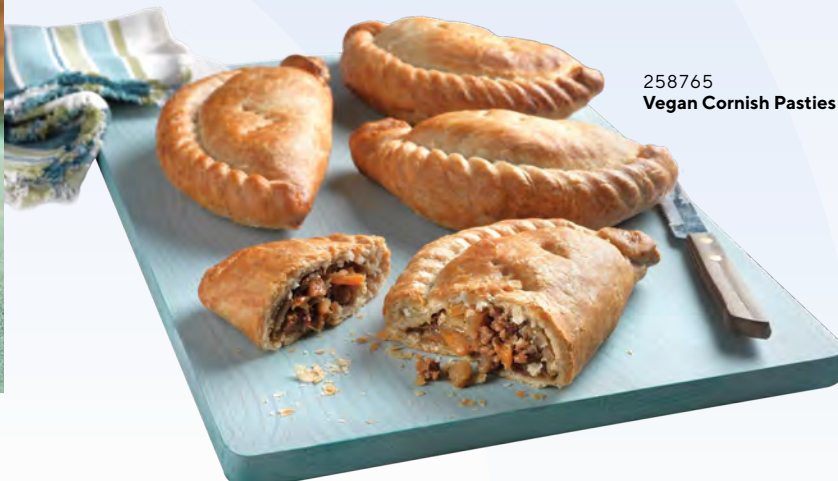
258765 Vegan Cornish Pasties 283g