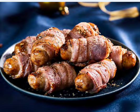
30698 Uncooked Pigs in Blankets