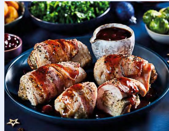
30706 Turkey & Stuffing Parcels 227g

80688 Wilsons Minced Beef 95% ○ ○ 2.5kg×1 PINACLE FOODS