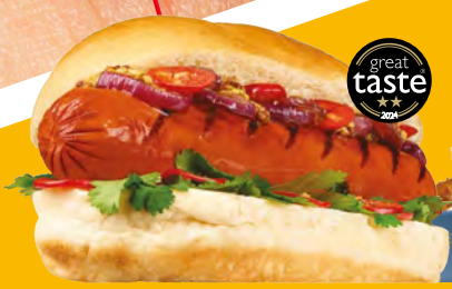
HOT DOG 80558