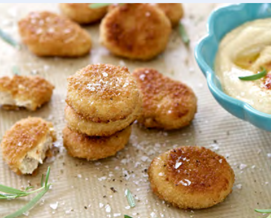
70162 Quorn Vegan Nuggets