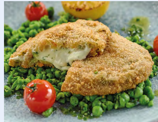
30844 Vegetable Kiev 125g