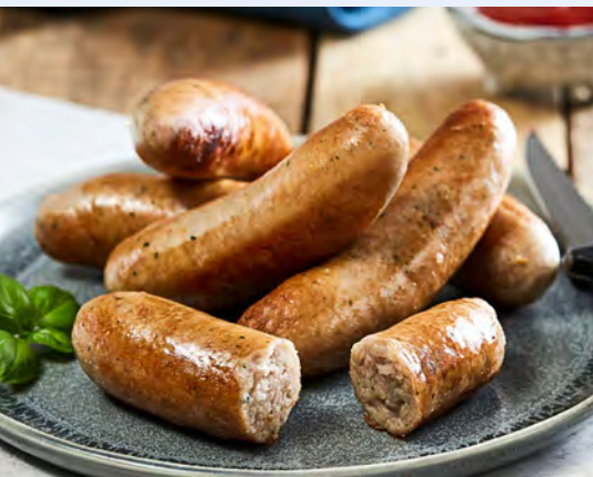
300156 Signature by Country Range Cumberland Sausages 14s