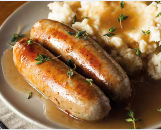
11422 Supreme Sausages 8s