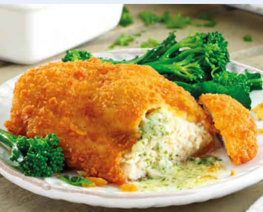
70836 Gluten Free Breaded Chicken Garlic Kiev 170g