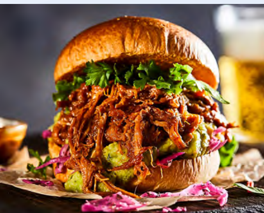
30904 Pulled Pork in BBQ Sauce