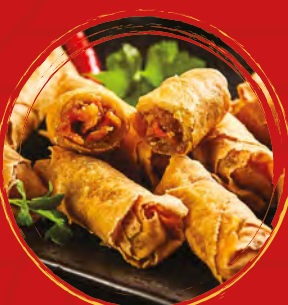
MINI DUCK SPRING ROLLS