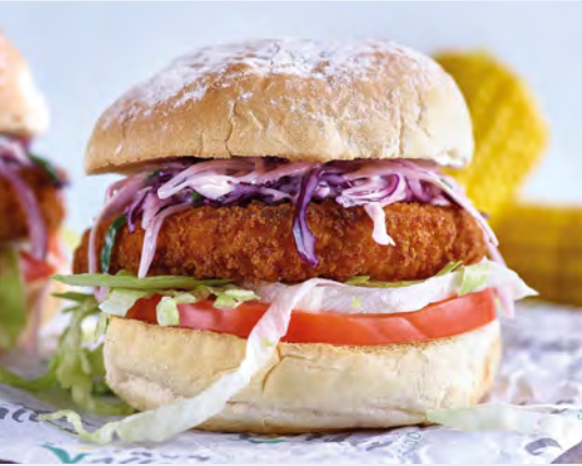
70771 Breaded Chicken Burgers 114g (1/4lb)