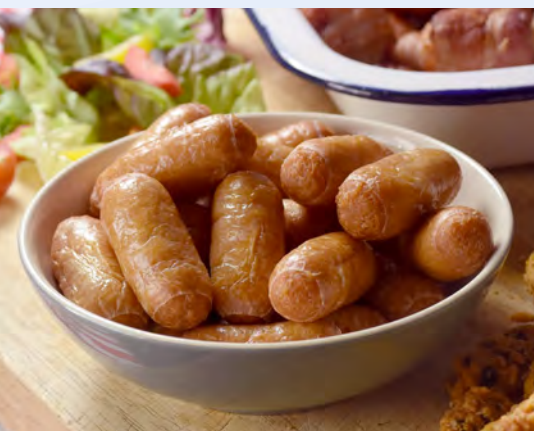
10242 Cocktail Sausages Cooked (32 per lb)