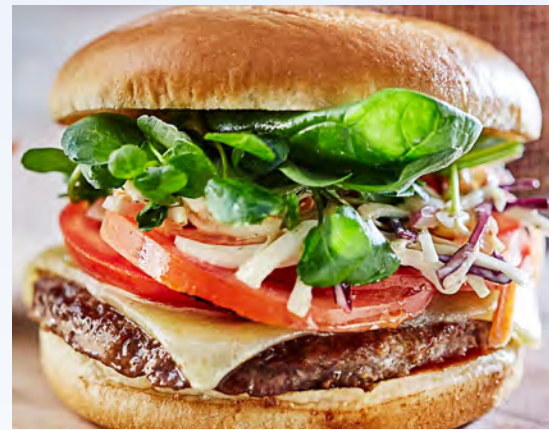
60874 100% Beef Burgers 113g (4oz) IQF Scored