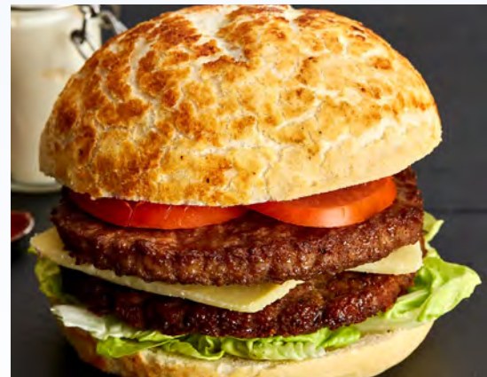
30782 Smash Burgers 85g