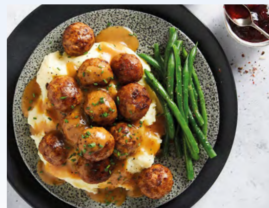
80963 Vegan Meatballs 14g