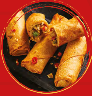
VEGETABLE SPRING ROLLS