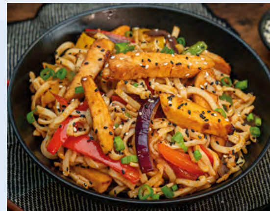
70504 Steam-Cooked Strip Chicken 12mm