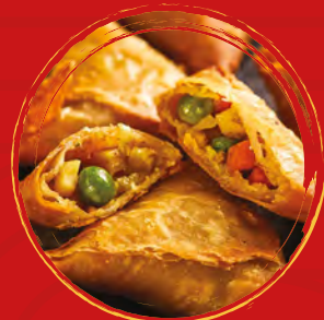
MINI VEGETABLE SAMOSAS