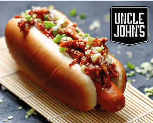
70176 Premium Bockwurst Beechwood Smoked 9" Sausages 90g