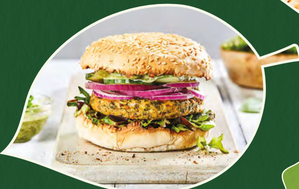
FALAFEL & SPINACH BURGER