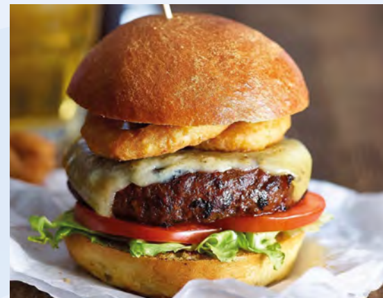
80604 Vegan Burgers 175g