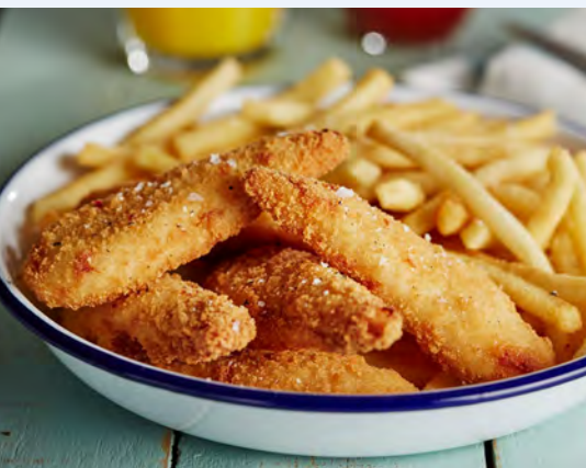
70811 Breaded Chicken Strips (Goujons)