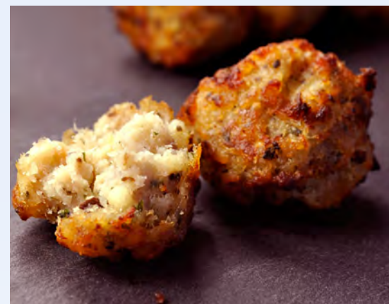
10258 Gastro Pork Stuffing Balls 10s