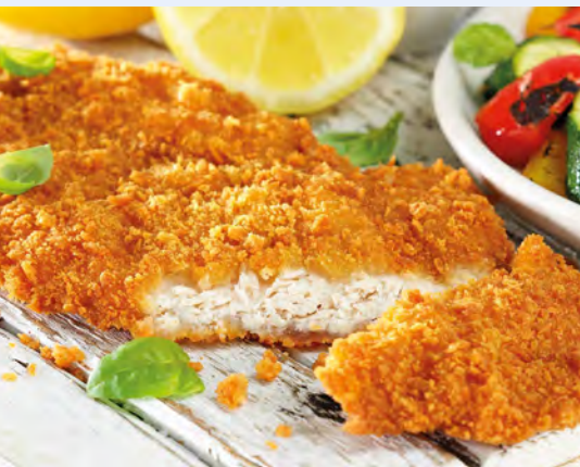
30308 Gluten Free Breaded Chicken Schnitzel 125g