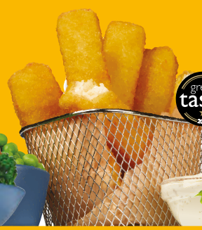
FISH FINGERS 80582