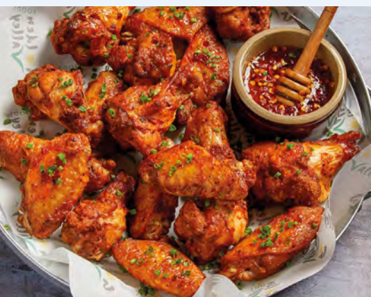
70536 Hot 'n' Spicy Chicken Wings