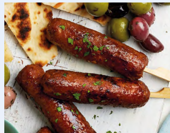
30141 Vegan Kofta Kebabs