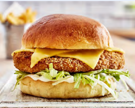
125536 Quorn Vegan Buttermilk Chicken Burger