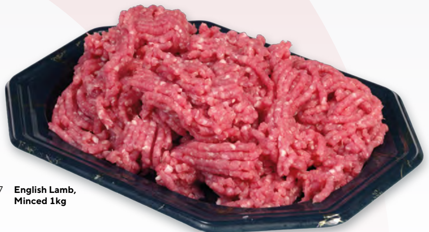
81157 English Lamb, Minced 1kg