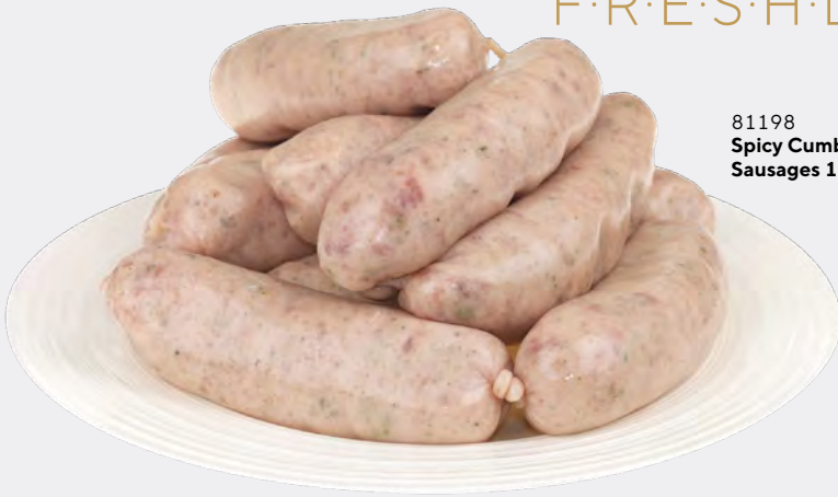
81198 Spicy Cumberland Sausages 1kg