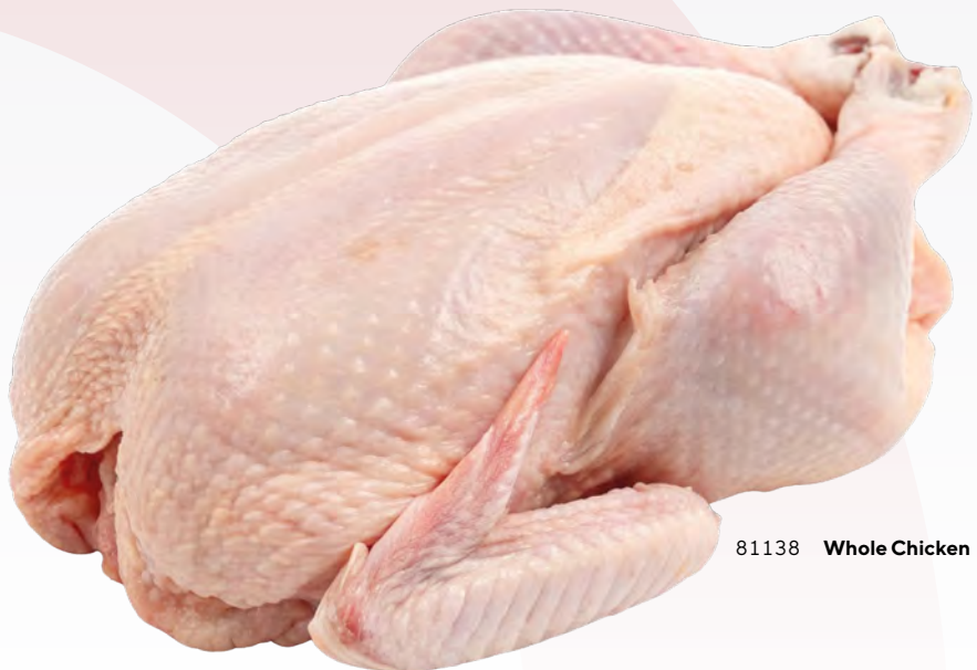
81138 Whole Chicken