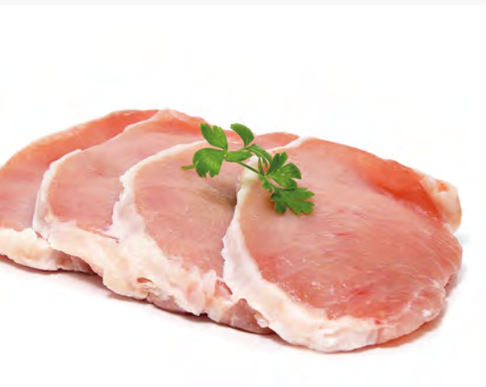
71416 Pork Loin Steaks 1kg