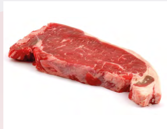
81128 Whole Strip Striploin 1kg