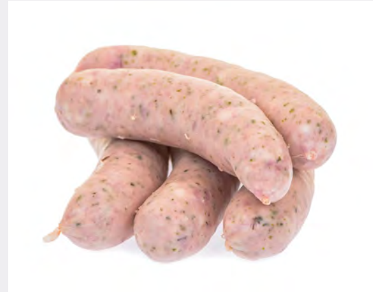
80526 Sage Pork Sausages 8s (Frozen)