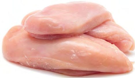
90410 Chilled Chicken Breast Fillets, British 5kg