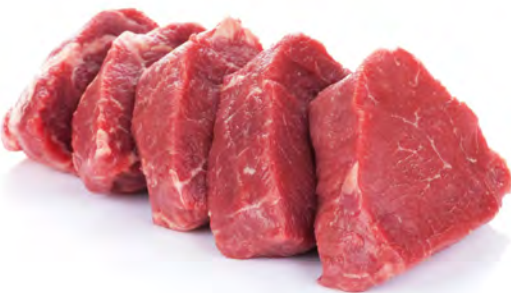
71445 Fillet Steak 6oz