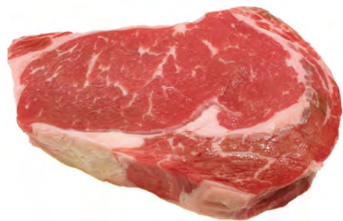
71437 Rib Eye Steak 10oz