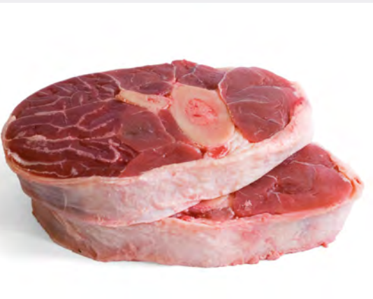
81135 Shin Beef 1kg