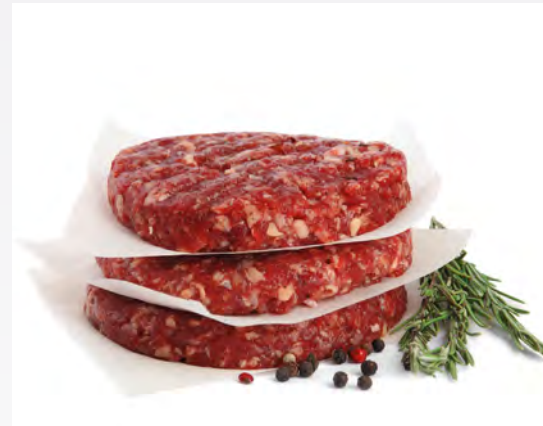
90800 Butchers Beef Burgers 8oz