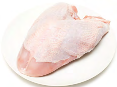
20866 Turkey Crowns 1kg