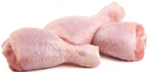
91114 Chicken Drumsticks (Frozen) 50s