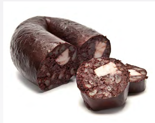
71432 Black Pudding Rings 1kg