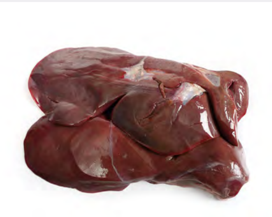
40013 English Lamb's Liver 1kg