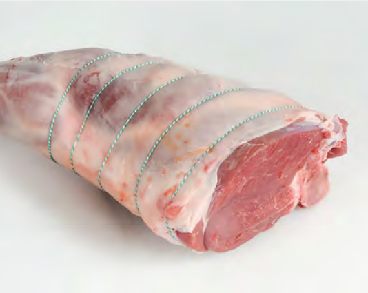
81150 Leg of Lamb (Boneless) 1kg