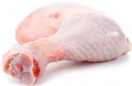
81142 Chicken Legs