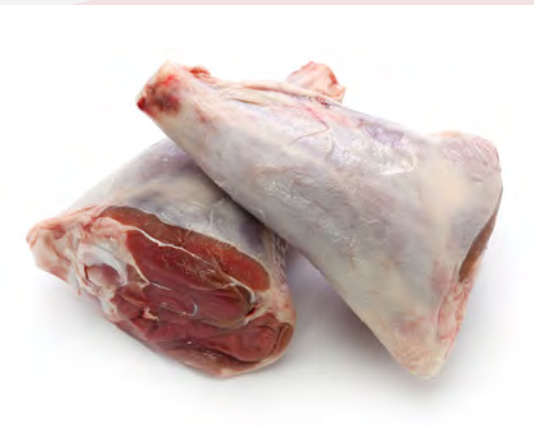
81158 Lamb Shanks