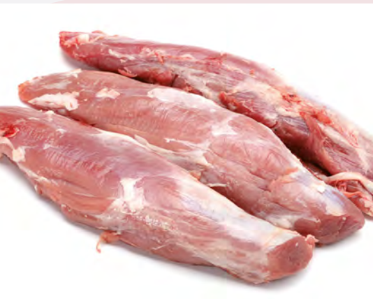
71413 Whole Pork Loin (Rindless) 1kg