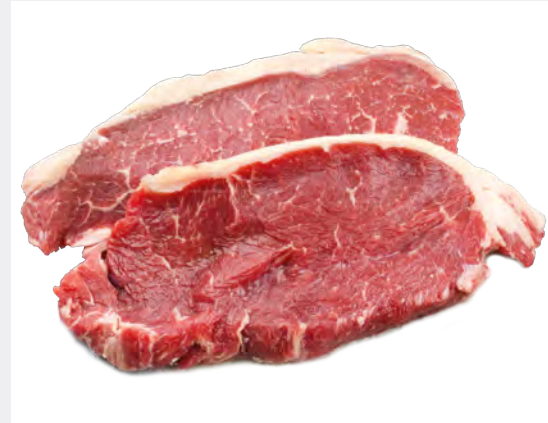
81120 Sirloin Steak 10oz