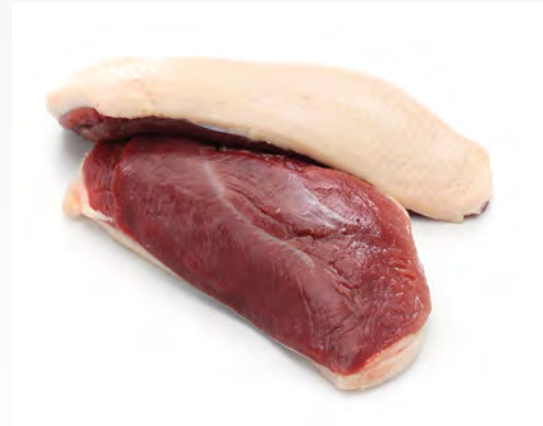
10416 French Duck Breast (2 Pack)