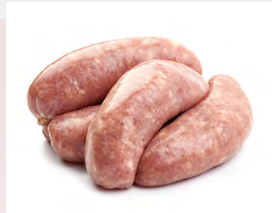
31056 Pork Sausages, Thick