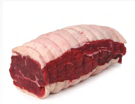
81126 Rolled Silverside 1kg