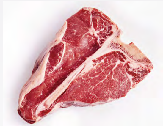
71450 T Bone Steak