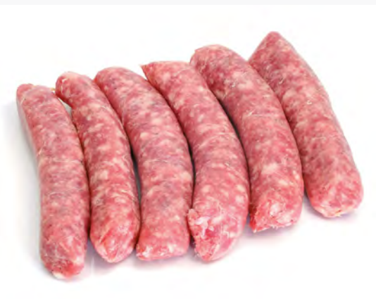
31056 Pork Sausages, Thick 1kg