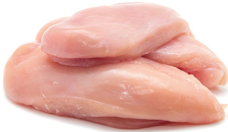
90410 Chilled Chicken Breast Fillets, British 5kg