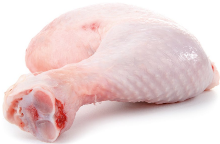
81142 Chicken Legs