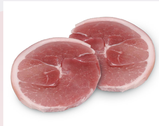
177864 Horse Shoe Gammon Steaks 8oz