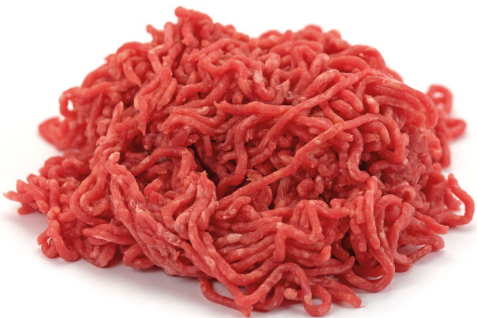
30017 Minced Beef, 95% Lean