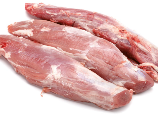
71413 Whole Pork Loin (Rindless) 1kg