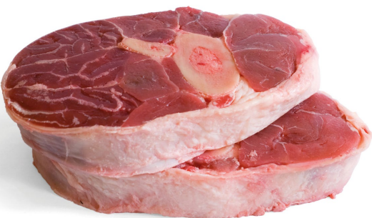
81135 Shin Beef 1kg