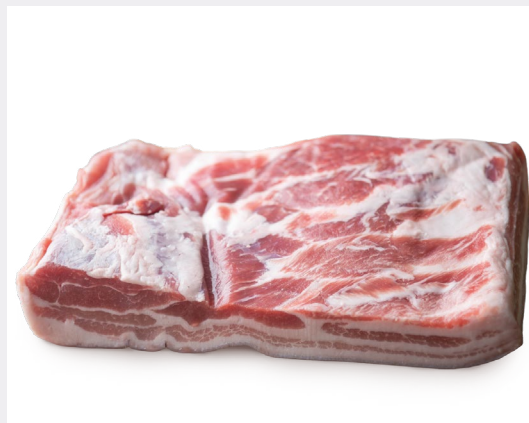
71409 Whole Pork Belly 1kg