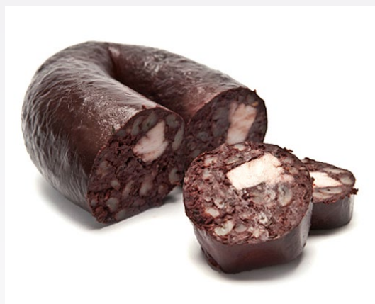
71432 Black Pudding Rings 1kg