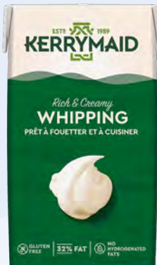
81419 Kerrymaid Whipping Cream 1 Litre