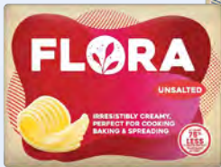
10469 Flora Plant Butter, Unsalted 250g