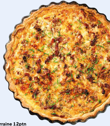
58191 Quiche Lorraine 12ptn