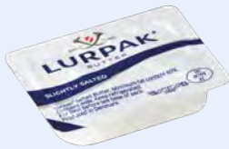
40581 Lurpak Butter Portions, Slightly Salted 10g