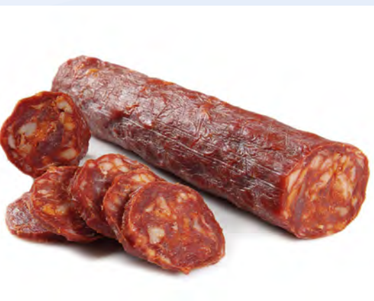
20430 Chorizo 1.8kg