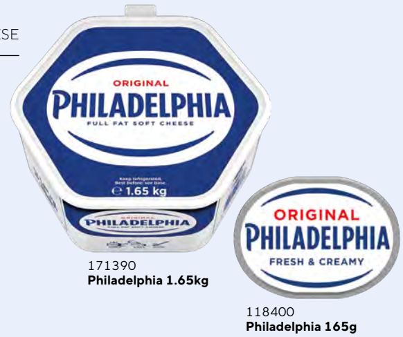
171390 Philadelphia 1.65kg