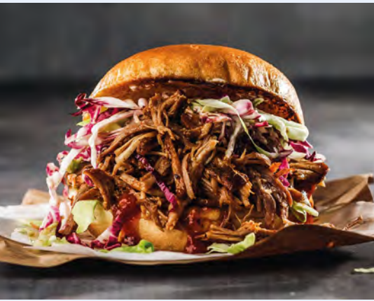
41448 Pulled Pork Fresh Sandwich Filler 1kg