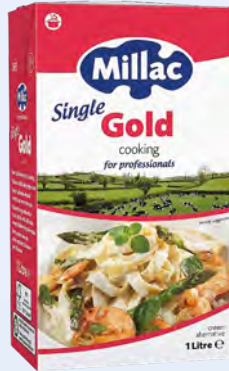
34095 Millac Gold Single Cream 1 Litre