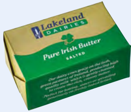
185255 Salted Butter 250g