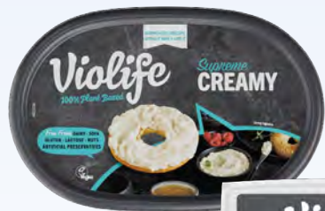
20692 Violife Supreme Creamy 200g