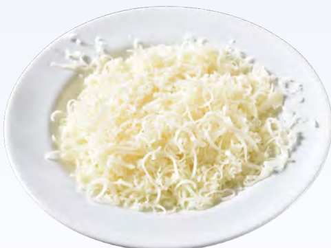
170262 Grated Mozzarella 100%