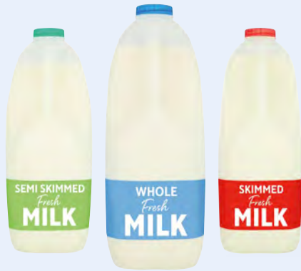
VAR Eden Fresh Milk 2 Litres