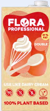
70525 Flora Professional Plant Double 1 Litre