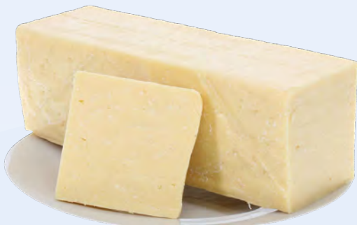
300521 Signature Extra Mature Cheddar 5kg