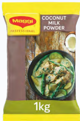
020826 Maggi Coconut Milk Powder 1kg