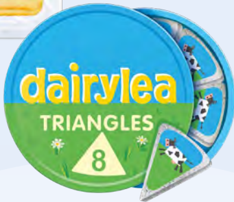
85753 Kraft Dairylea Portions 125g