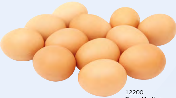
12200 Eggs, Medium Dozen x15