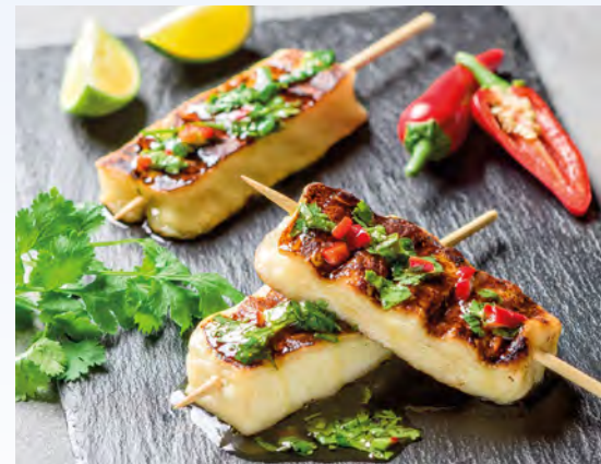
30944 Yamas Halloumi Cheese 250g