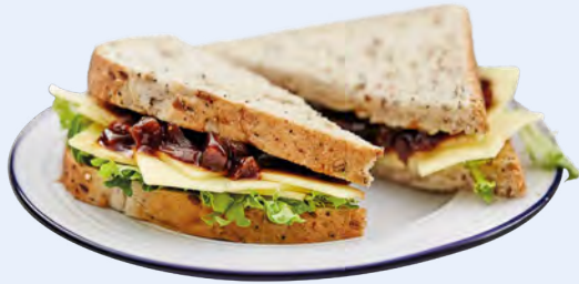
170710 Mature Cheddar, Sliced 1kg