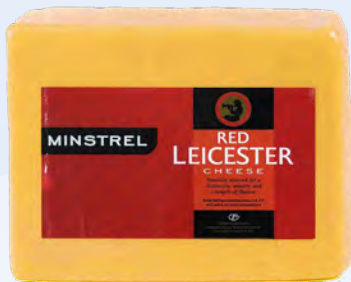
172772 Minstrel Red Leicester 2.5kg