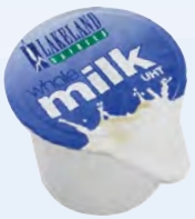
47104 Lakeland Whole Milk Portions 13.6ml