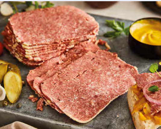
24897 Sliced Corned Beef 500g