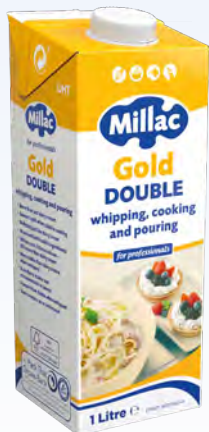
170052 Millac Gold Double Cream 1 Litre