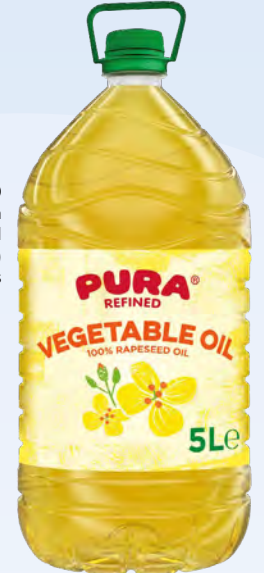
109910 Pura Vegetable Oil (100% Rapeseed) 5 Litres