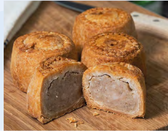
21148 Fresh Buffet Pork Pies