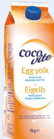
10002 Liquid Egg White 1kg 40292 Liquid Egg Yolk 1kg