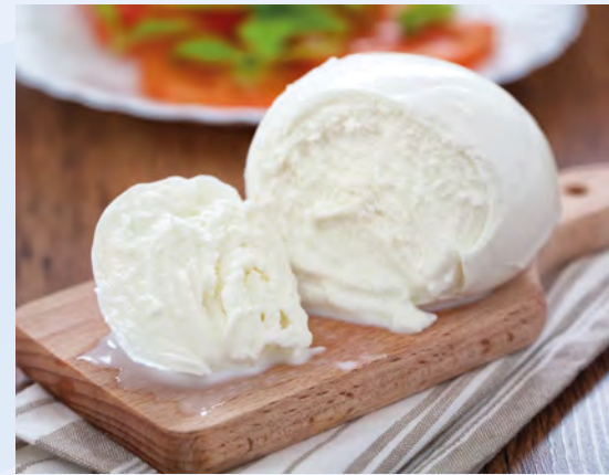
27860 Mozzarella 125g