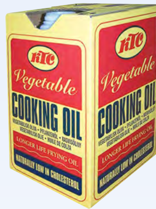
20639 KTC Vegetable Oil 20 Litres