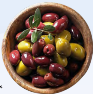
30471 Mistoliva Mixed Olives 3kg