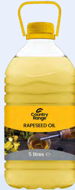
125896 Country Range Extended Life Rapeseed Oil 5 Litres