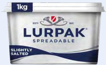
70178 Lurpak Spreadable 1kg