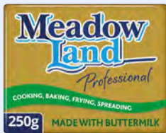
31499 Meadowland Professional 250g