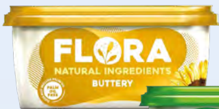
36083 Flora Buttery 2kg