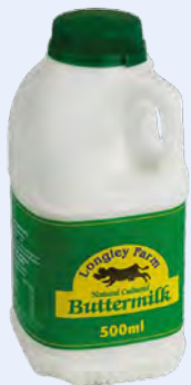
91153 Longley Farm Natural Cultured Buttermilk 500ml