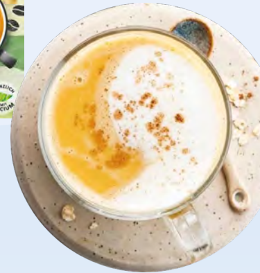
VAR Alpro Professional Barista 1 Litre