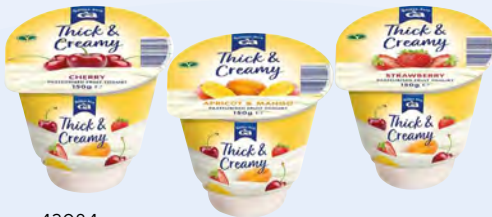
43084 Goldenacre Assorted Long Life Yoghurt 150g