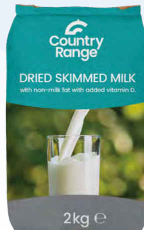
125896 Country Range Skimmed Milk 2kg