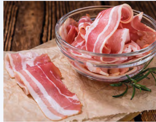
177024 Gran Bosco Sliced Prosciutto 500g