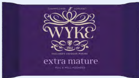
173518 Wyke Farms Extra Mature 5kg*