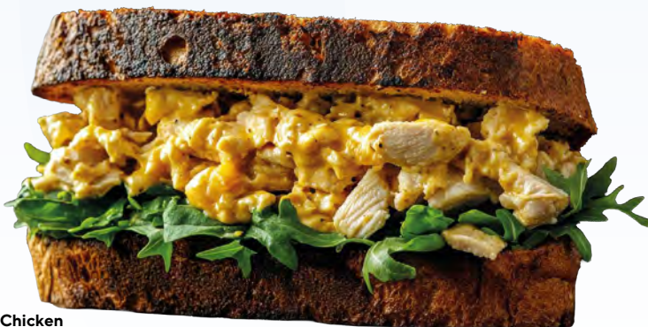
172737 Coronation Chicken Fresh Sandwich Filler 1kg