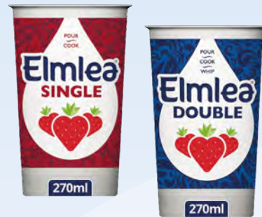
37284 Elmlea Single Cream 270ml 15912 Elmlea Double Cream 270ml