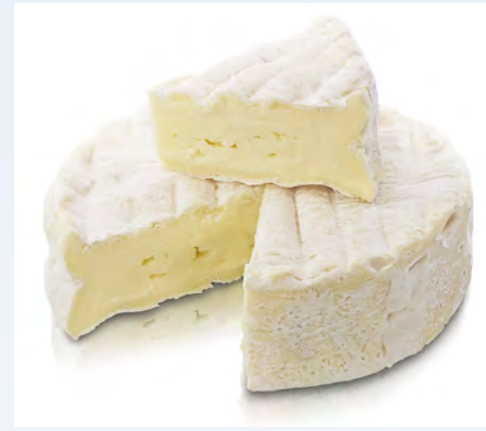
21207 Brie 1kg