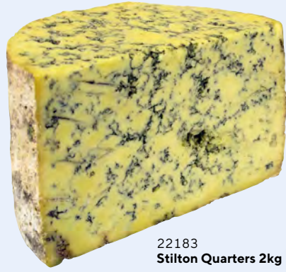
22183 Stilton Quarters 2kg