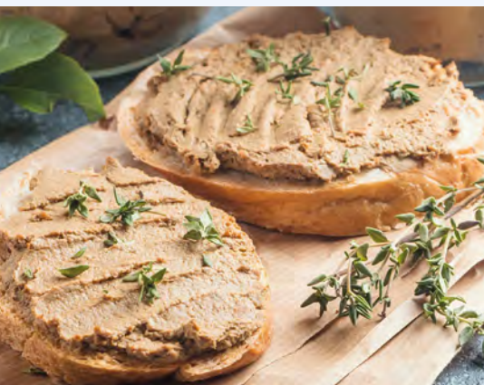
175689 Chicken Paté 1kg