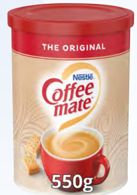
97607 Nestlé Coffee-Mate 1kg