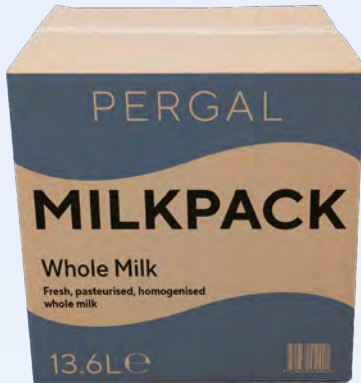
40034 Whole Milk Pergal 13.6 Litres