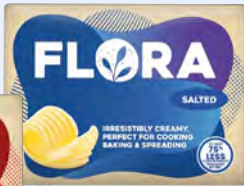
10486 Flora Plant Butter, Salted 250g