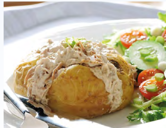
81000 Tuna Mayonnaise Fresh Sandwich Filler 1kg