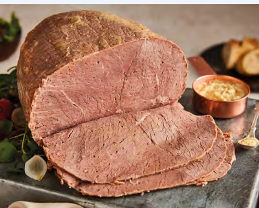
30617 Beef (Topside), Sliced 500g Red Tractor Assured