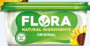
53268 Flora Original 2kg