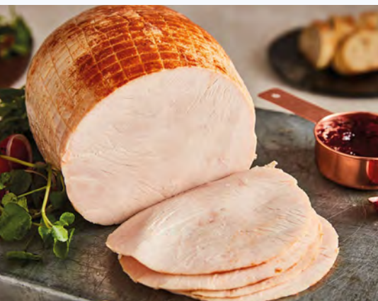
175903 100% Turkey Joint, Cooked 3.5kg