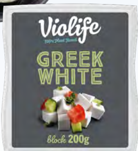
10021 Violife Greek White Block 200g