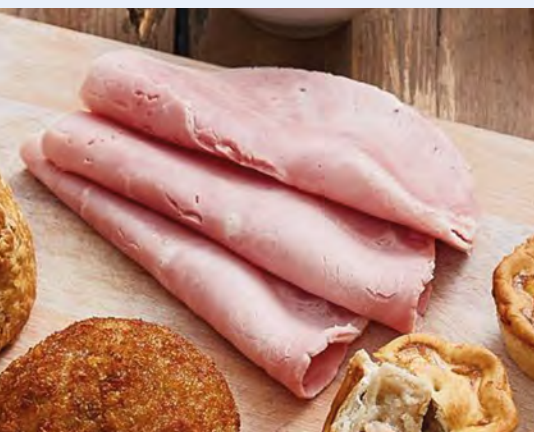
30599 Wiltshire Gammon Ham, Sliced 500g