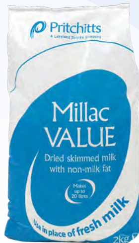
170676 Millac Value Skimmed Milk Powder 2kg