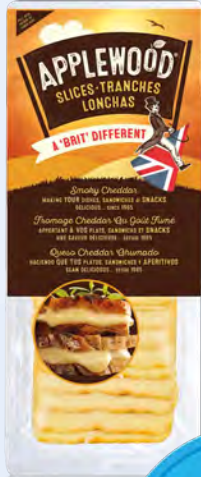
10530 Applewood Smoked, Slices 750g