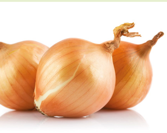
51287 Onions, Cooking