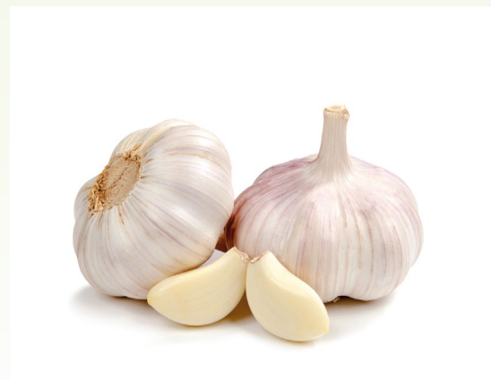
51269 Garlic Bulbs