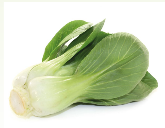
51276 Green Pak Choi