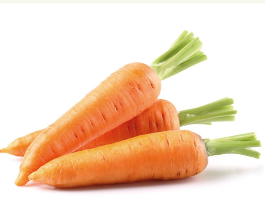
51257 Carrots, Large