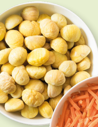
51208 Chestnuts Vac Pak Cooked 200g