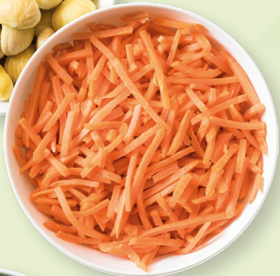
51205 Carrots, Julienne 2.5kg