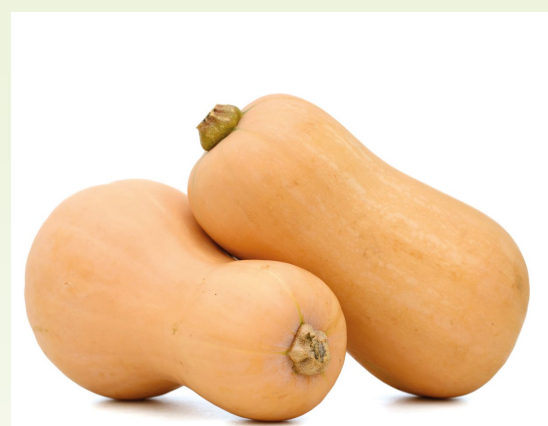
51242 Butternut Squash