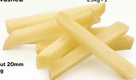
90342 Chips, Hand Cut 20mm Maris Piper 5kg