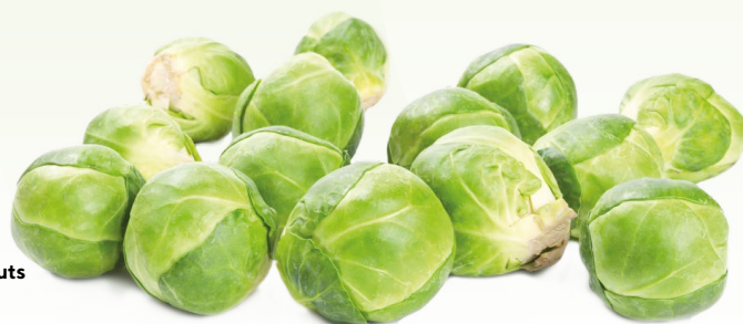
51241 Brussel Sprouts