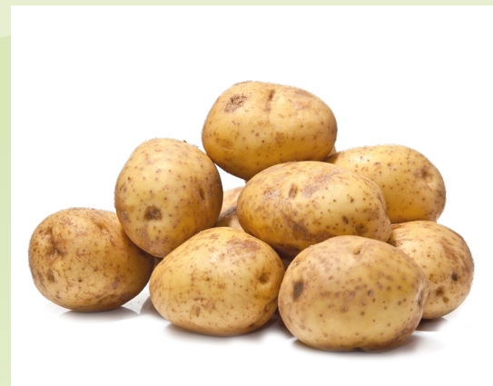
31479 Potatoes, Mids, Washed 10kg