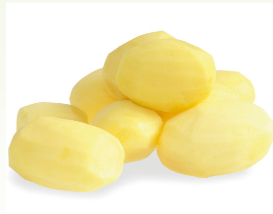
51137 Whole Potatoes, Peeled 5kg