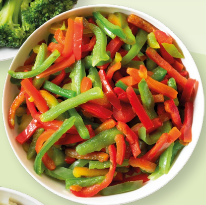
99885 Sliced Mixed Peppers 2.5kg