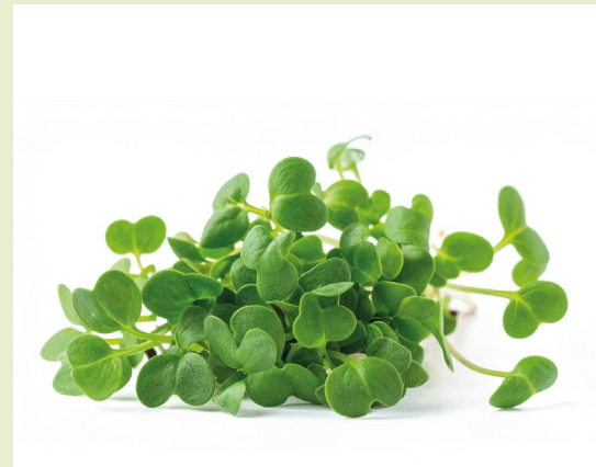
51488 Micro Cress Watercress