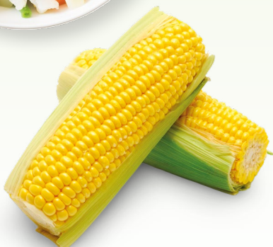
51218 Corn On Cob, Pre-Pack: 2s