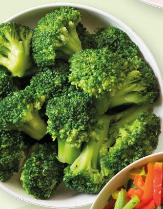
51200 Broccoli Florets 2.5kg