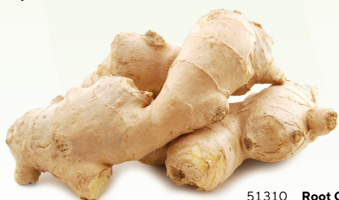
51310 Root Ginger