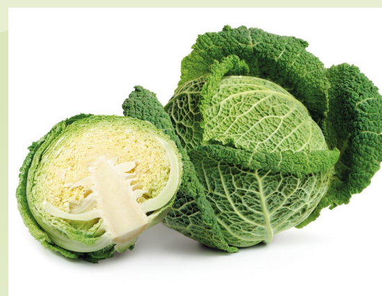
51245 Cabbage, Green Savoy