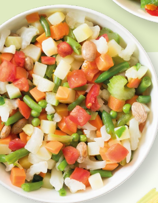
51216 Minestrone Mix 2.5kg