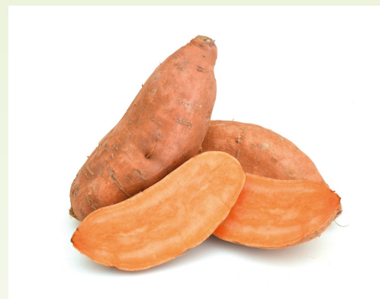
51143 Potatoes, Sweet 6kg