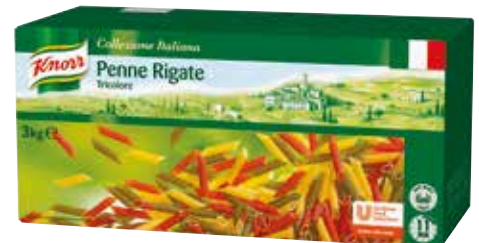
170811 Knorr Penne Rigate Tricolore