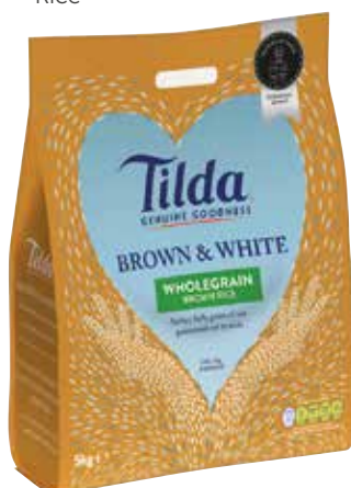
031026 Tilda Easy Cook Brown & White Rice