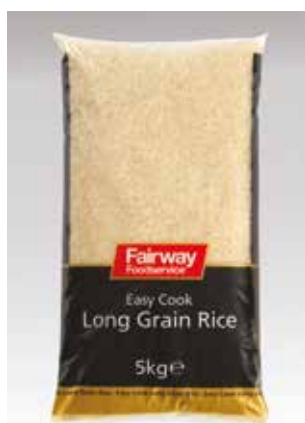
170805 Fairway Easy Cook Long Grain Rice