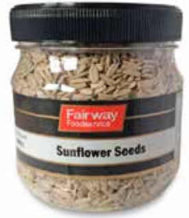
172280 Fairway Sunflower Seed