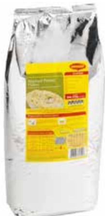
189760 Maggi Cold Mix Mash Potato