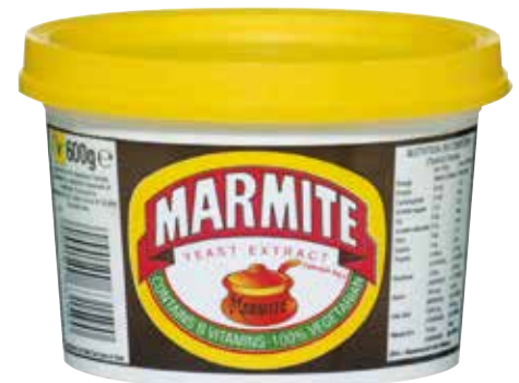
017880 Marmite Tub (Plastic)