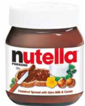
189044 Nutella Chocolate Spread