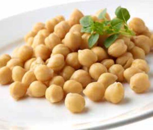
160775 Dried Chick Peas