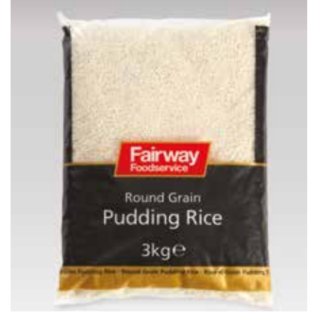
169010 Fairway Pudding Rice