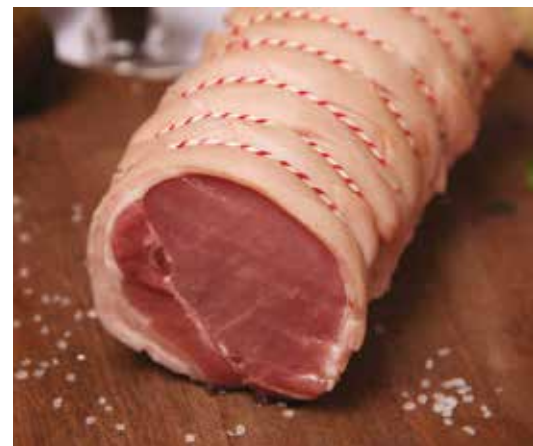
Pork Loin Skin On Bone Removed