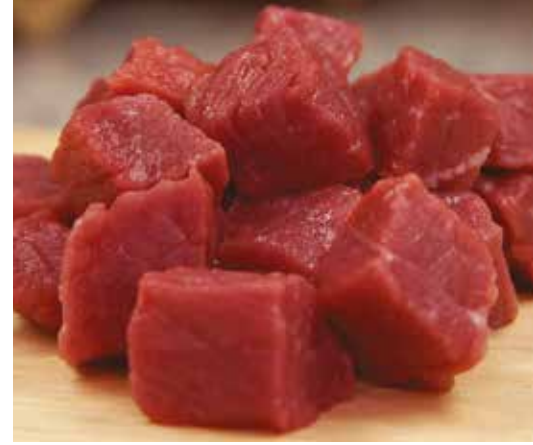
Diced Stew Steak