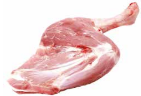
Shoulder of Lamb