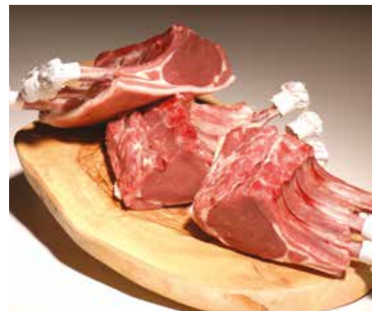
Rack of Lamb - French Trimmed