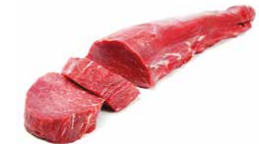
Pork Tender Loin