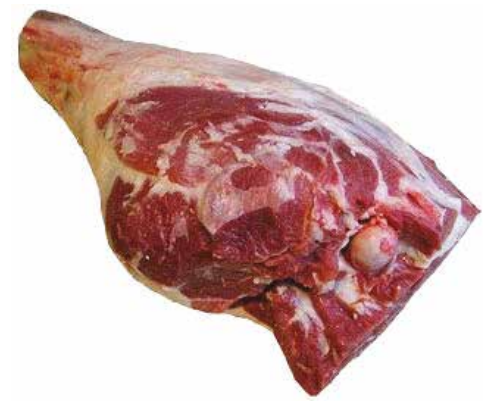
Leg of Lamb