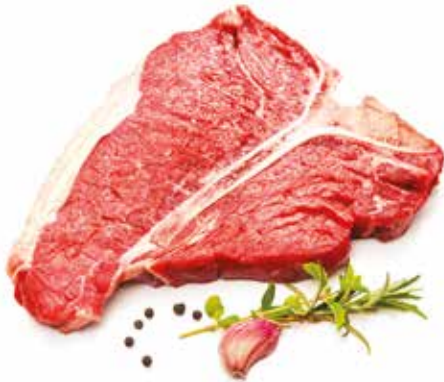
T Bone Steak